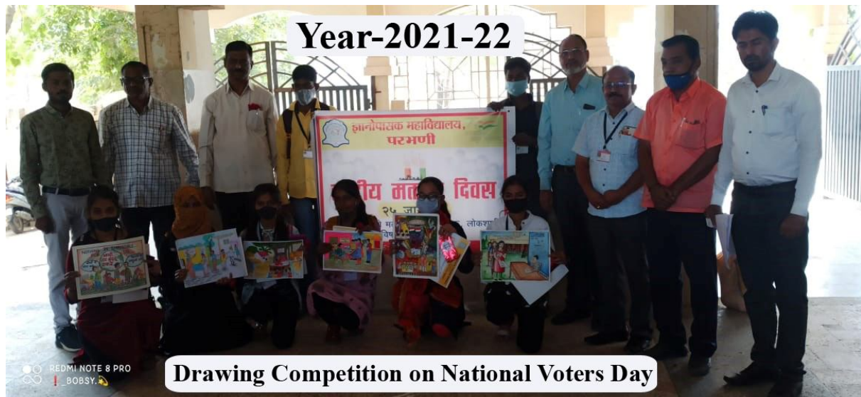
Drawing Competition on National Voters Day