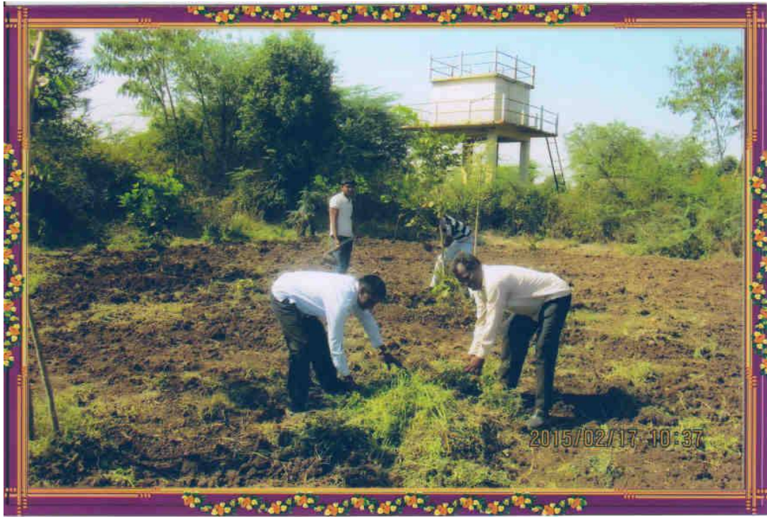
NSS Volunteers Cleaning the land of water tank at Tuljapur