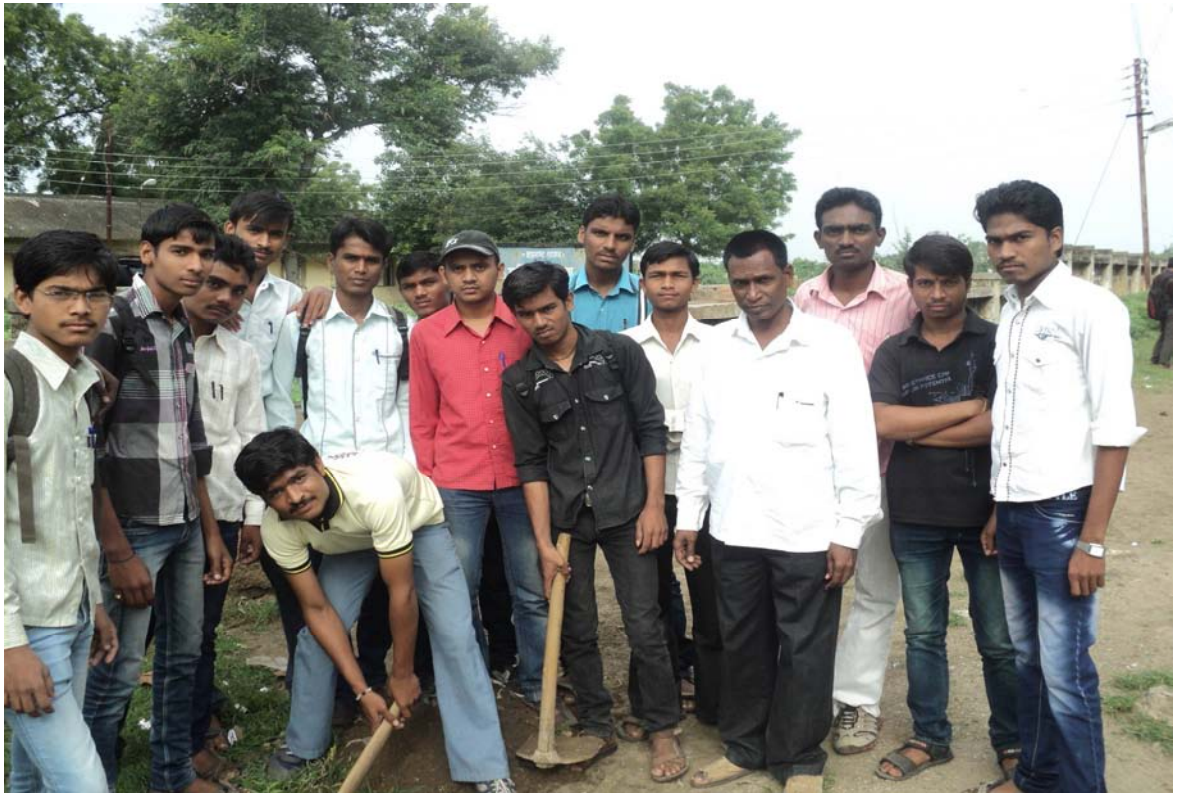
NSS Volunteers preparing 'Rough Pit' at Tatu Jawala village