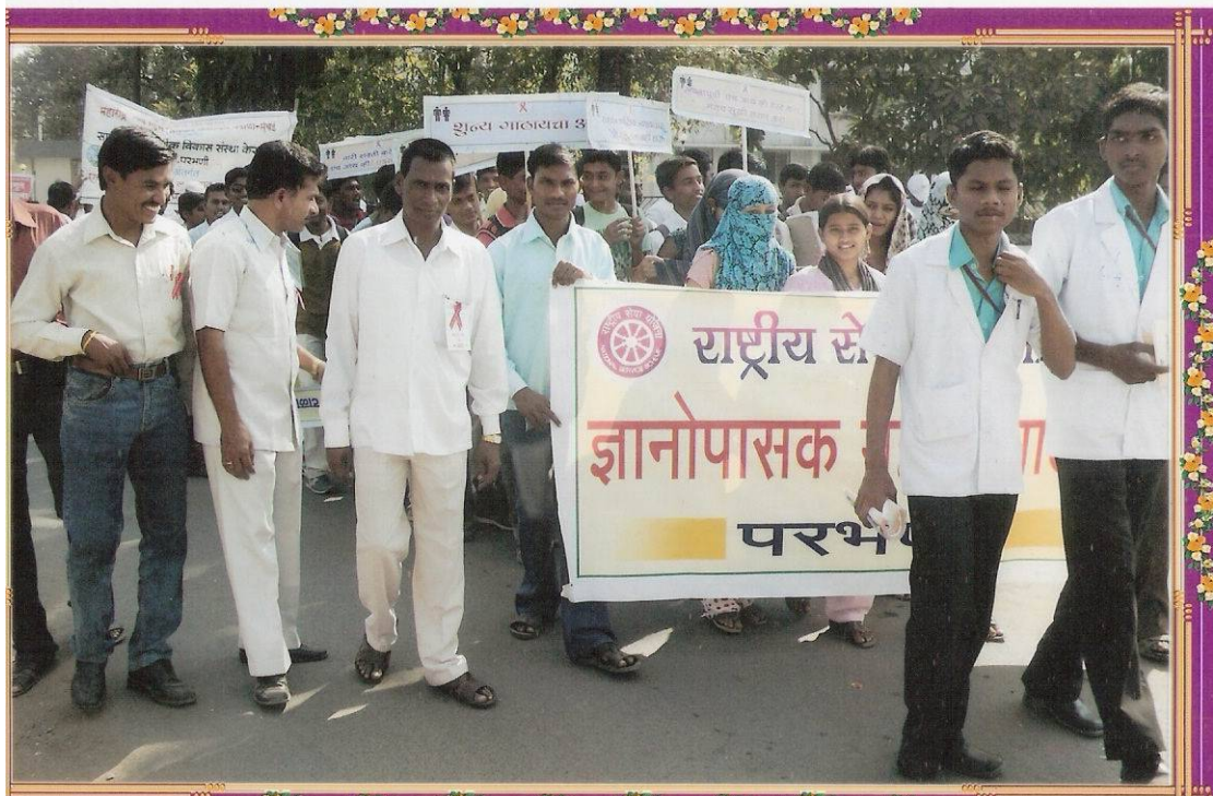
Participation in AIDS Awareness Rally organized by Dist. Civil Hospital, Parbhani with NSS Volunteers