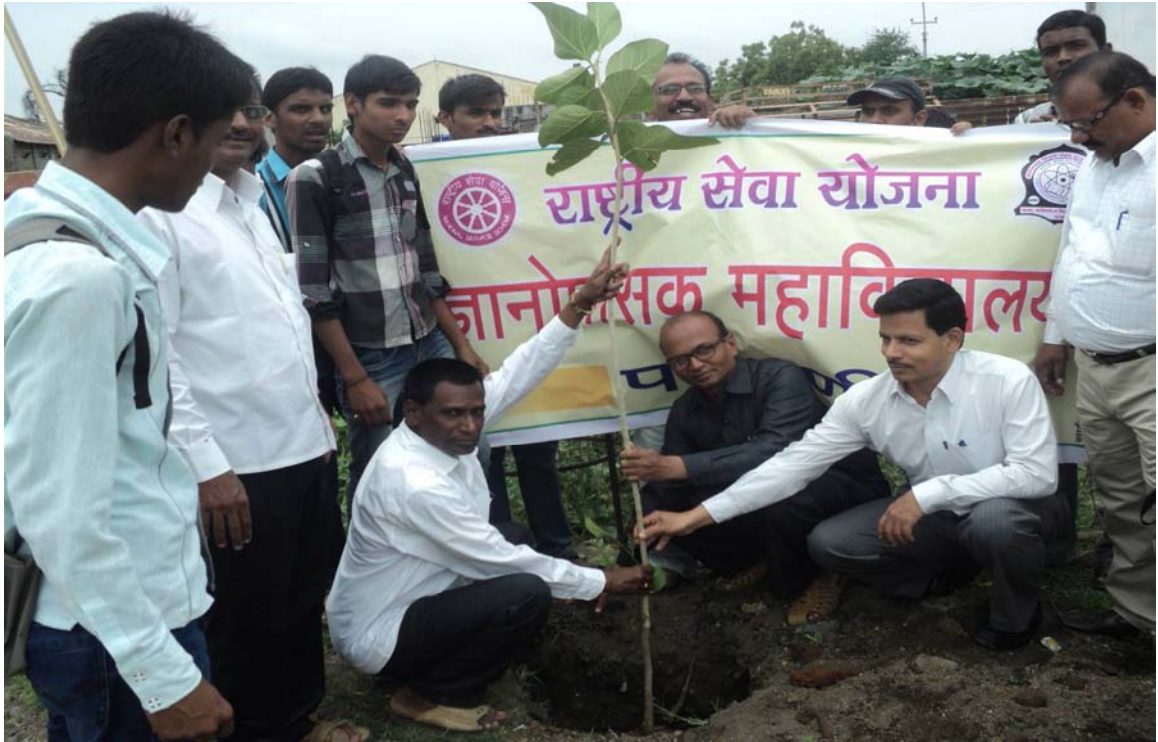
Organization of "Tree Plantation" in the College campus along with NSS Volunteers