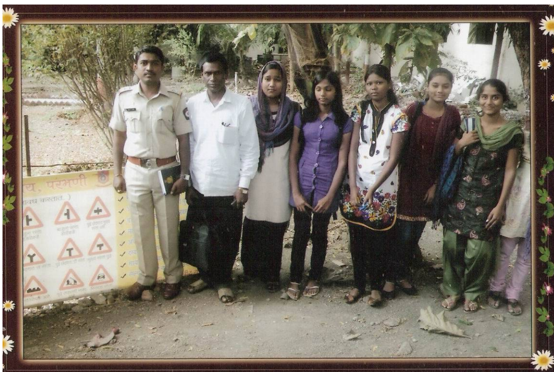
NSS Volunteers , Asst. R.T.O. expressing The Rules of Traffic