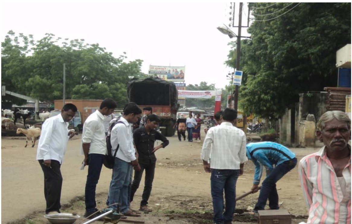
Drainage Cleanliness by the NSS Volunteers