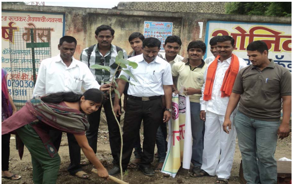
Organization of Tree Plantation at Pandurang Nagar, Parbhani with NSS Volunteers