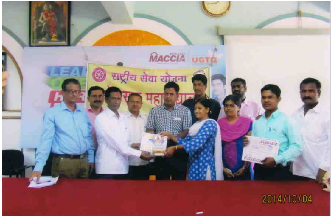
The NSS Unit has successfully organized a Blood Donation Camp and honored by Civil Hospital, Parbhani by giving Certificates to the NSS volunteers