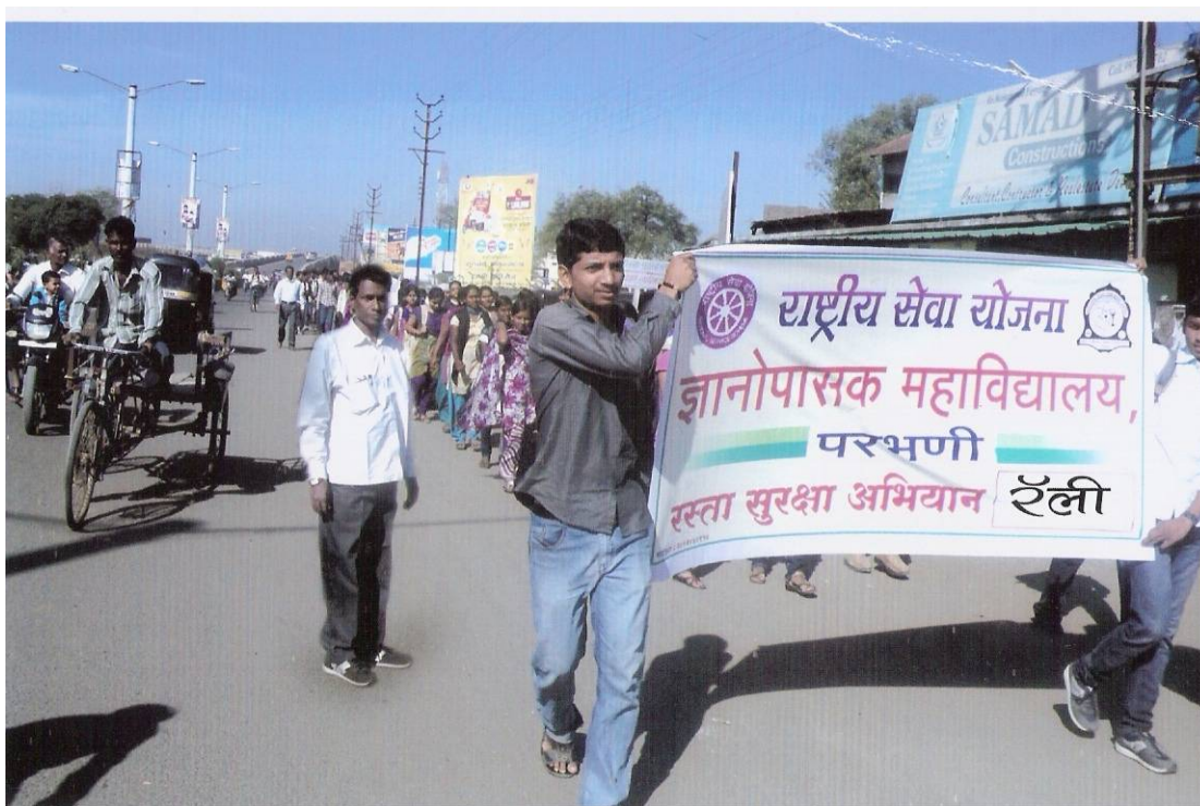
Participation in 'Road Safety Abhiyan Rally' along with NSS Volunteers