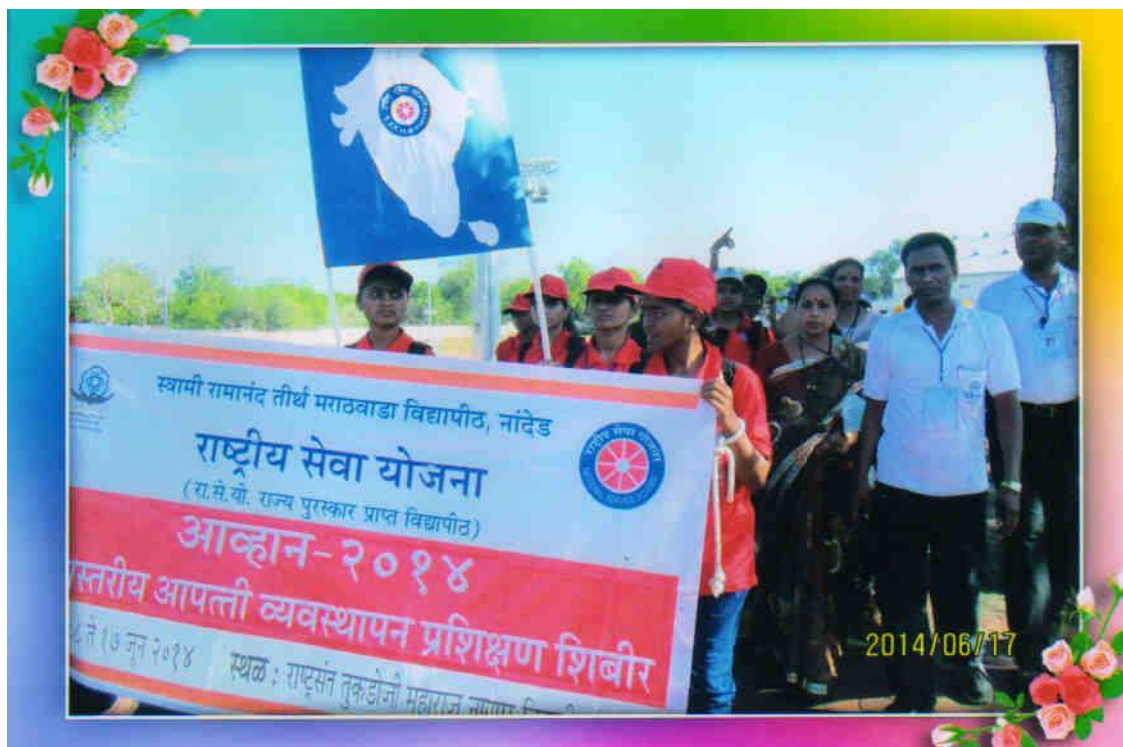
NSS Volunteers participated in National Disaster Management Training Camp