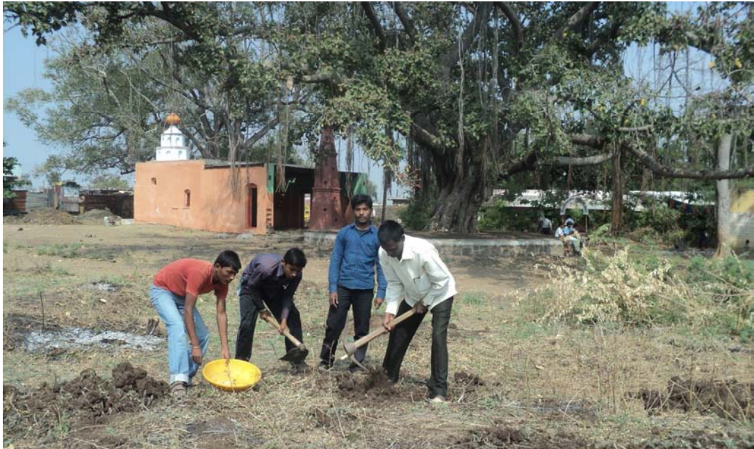
NSS Volunteers Cleaning the campus of Devi Temple at Tuljapur