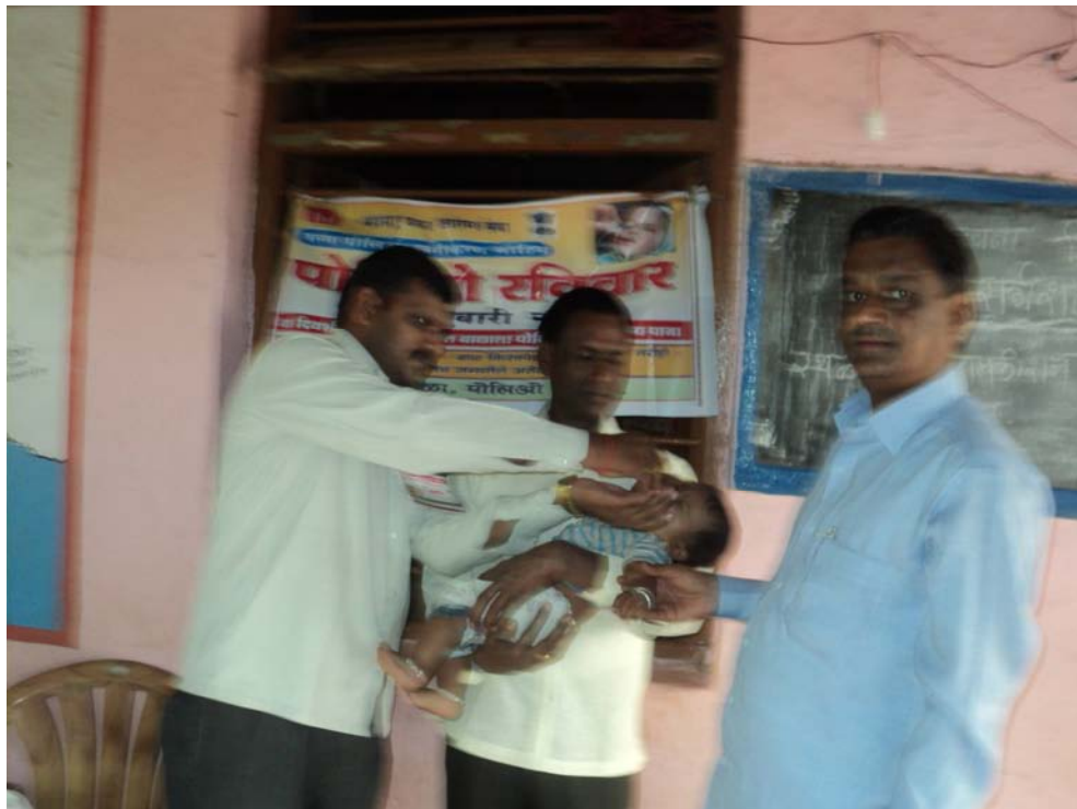
NSS Unit has taken a programme of 'Pulse Polio' at Tuljapur