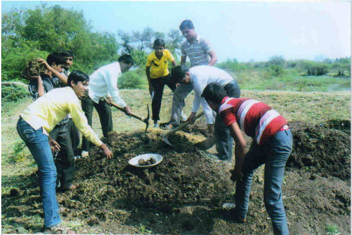
NSS Unit Volunteers of the College preparing Hole Pits at Tuljapur during the Special Camping