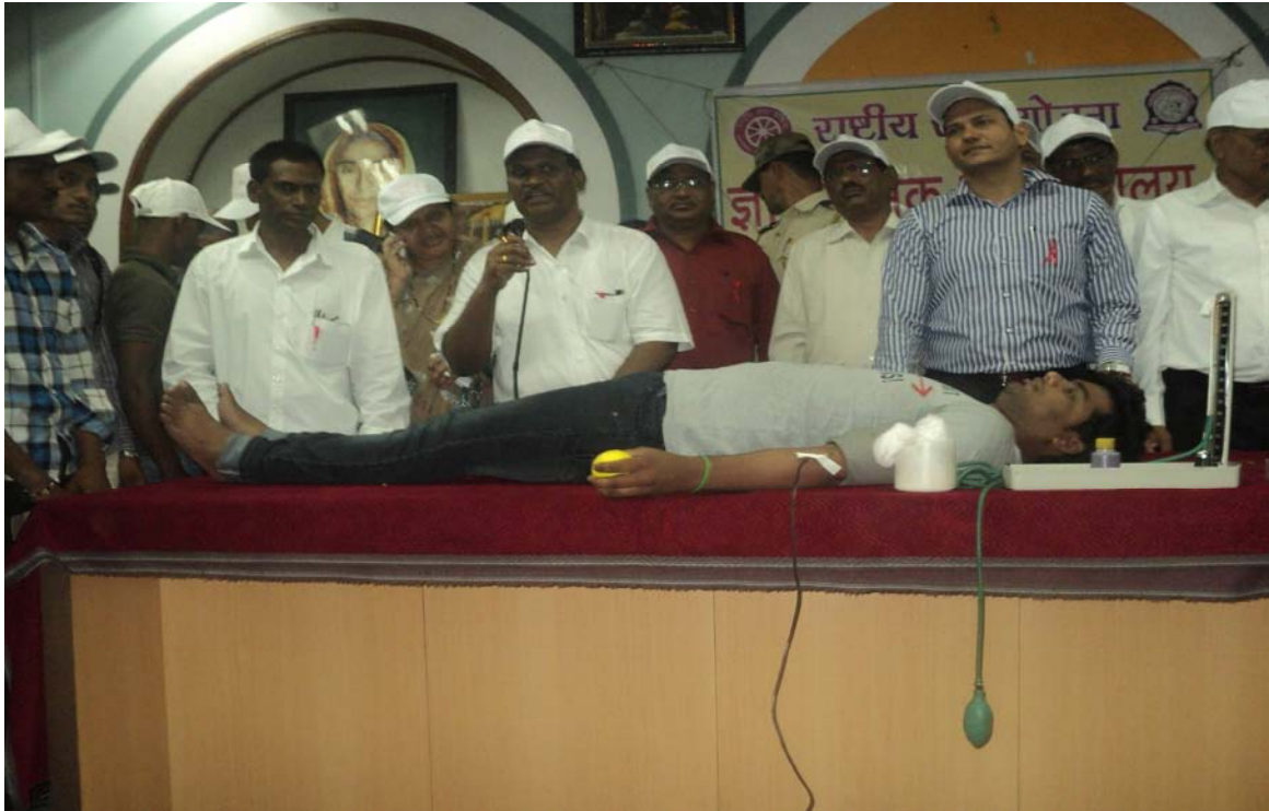
Blood donation camp by NSS Unit in the college