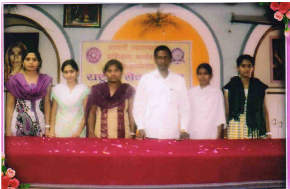
NSS Volunteers participated in "Disaster Management Training" Workshop.