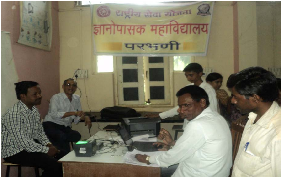
Organization of 'Adhar Card Camp in the College