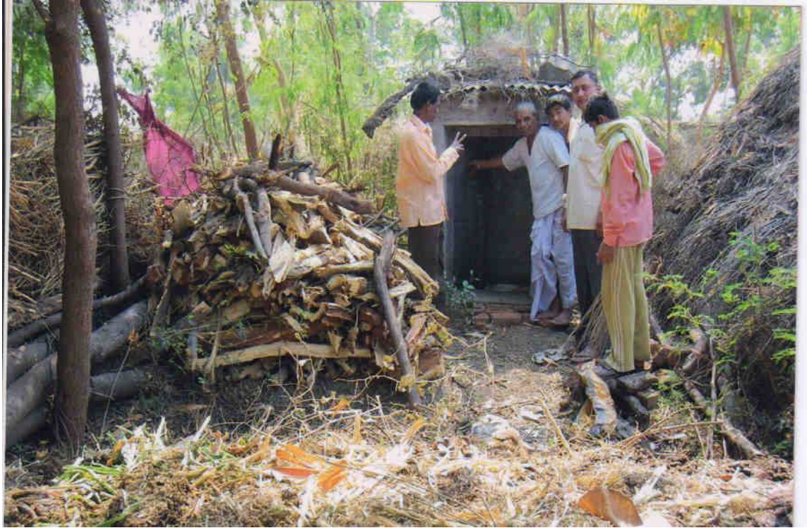
The NSS Unit has constructed Toilets at adopted village Tuljapur