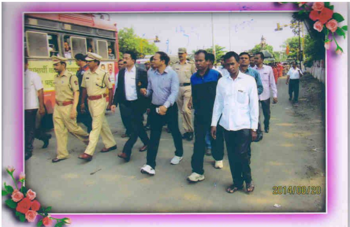
The NSS Unit Volunteers participated in the Sadbhavan Rally along with District Collector & Suptd. of Police.