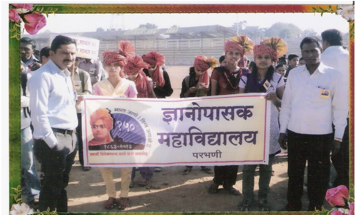
On the occasion of Vivekanand Jayanti a Rally organized by NSS Unit