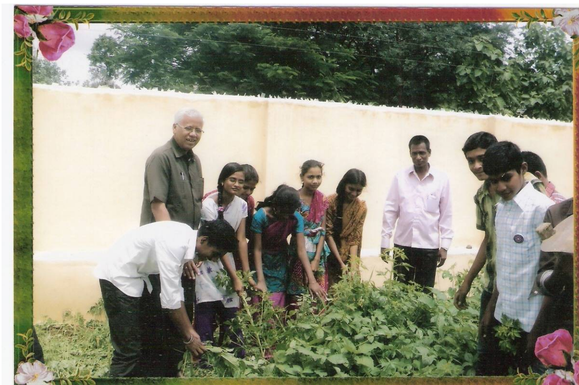
NSS Volunteers Cleaning the Grass in Girls Hostel of the College