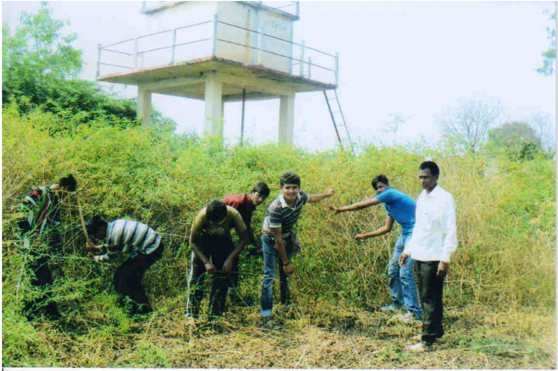
NSS Volunteers Cleaning the village campus at Tuljapur.