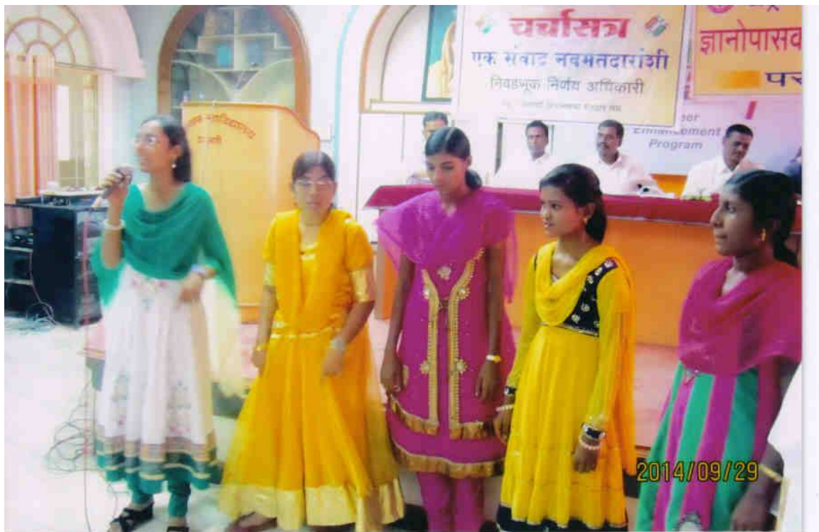
NSS Volunteers participated in the 'Voters Awareness Programme'